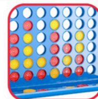
Giant Connect Four Hosted by OES

All Masonic bodies within the Mohave Shrine Club and their families are invited! Meat will be provided – please bring your favorite side dish to share. Enjoy games, great company, and a full day of laughter and memories. Many are staying the weekend in cabins, RVs, or tents – contact Hualapai Mountain Park to reserve your spot. Let's make it a weekend to remember!