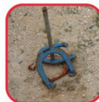
Horseshoe Tournament Hosted by Lodge