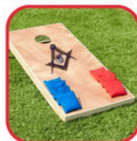
Cornhole Tournament Hosted by LOS

Saturday, August 23, 2025 11:00AM – 7:00PM Hualapai Mountain Park Rec Area 3