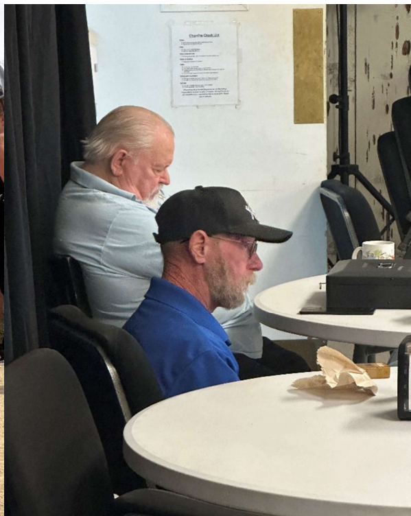
A little down time between Corn Fest, Bunco, Trunk or Treat, and Sunday Football at the Shire