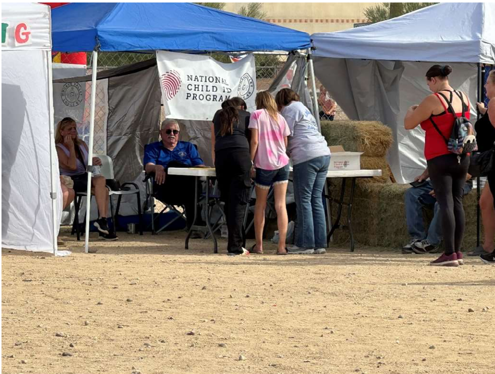
National Child ID Program At Corn Fest