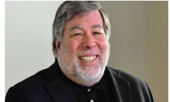
Steve Wozniak is an American engineer, philanthropist, entrepreneur and programmer.

In 1976, he co-founded Apple Inc. with Steve Jobs and Ronald W.