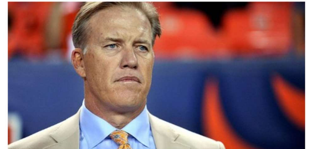
Former American Football Quarterback John Elway joined Freemasonry on June 28, 2002.