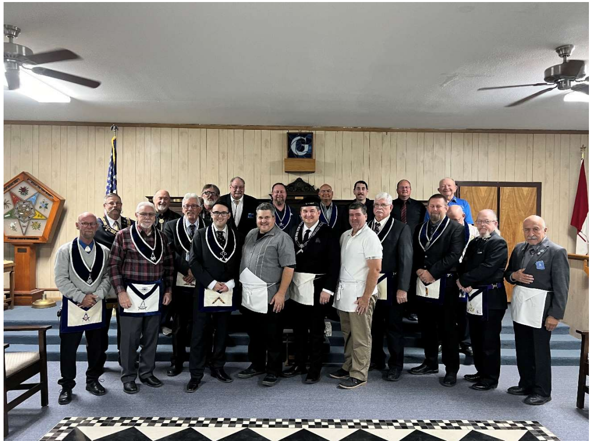
The Lodge welcomed two new Entered Apprentice Masons on November 16, 2022