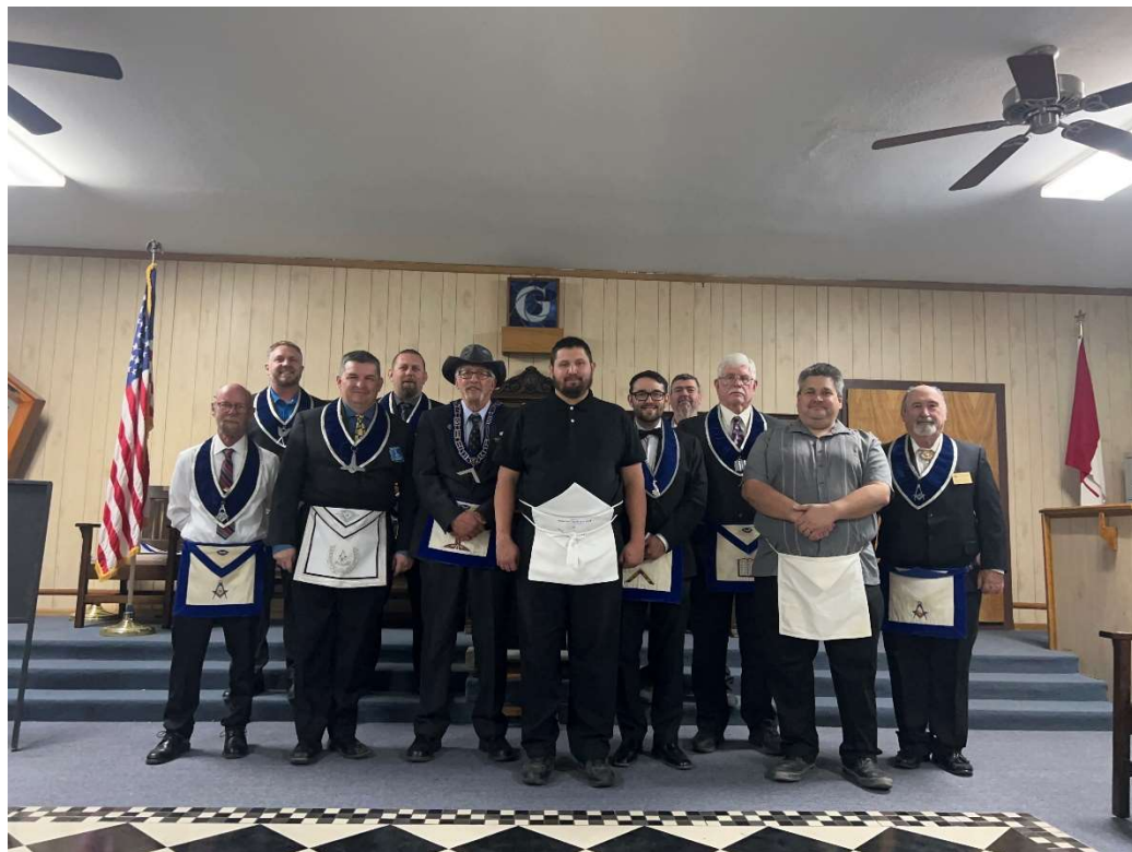
The Lodge welcomed a New Entered Apprentice Mason on November 30, 2022